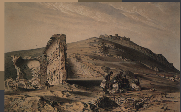
Théodore du Moncel, "Antiquités d'Argos", in Excursion par terre d'Athènes à Nauplie , 1843.

American School of Classical Studies at Athens, Cotsen Hall (Anapiron Polemou 9) École française d'Athènes, Musée des moulages (Didotou 6) British School at Athens, Upper House (Soudias 52)